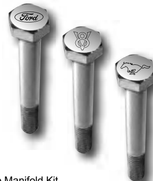
Intake Manifold Kit for 429 Engine Part # 11-56246-H