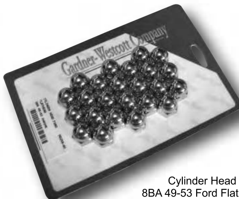
Cylinder Head 8BA 49-53 Ford Flathead Part # 56250-AC